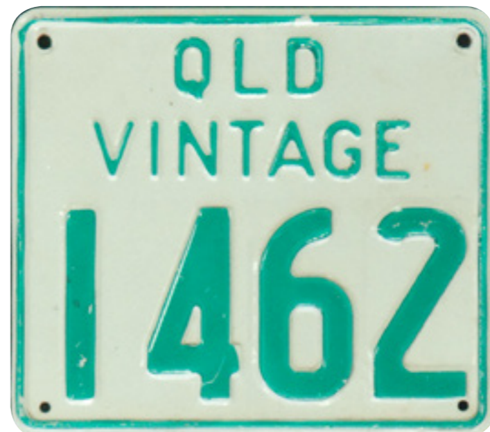
VINTAGE MOTOR VEHICLE 1983

Similar in format to veteran and historic motor vehicle plates, the vintage motor vehicle was introduced on May 11, 1970 with 001. The series extends to 199, then 300-999, and more recently from 1000 to 9999.