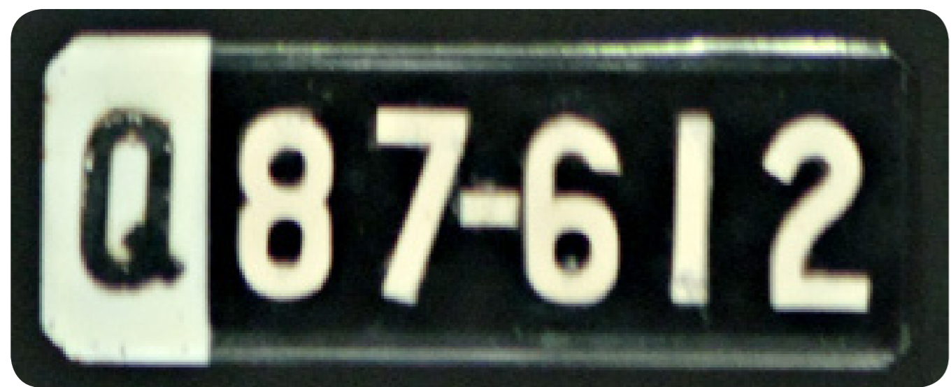
MOTORCYCLE 1921 – 1955