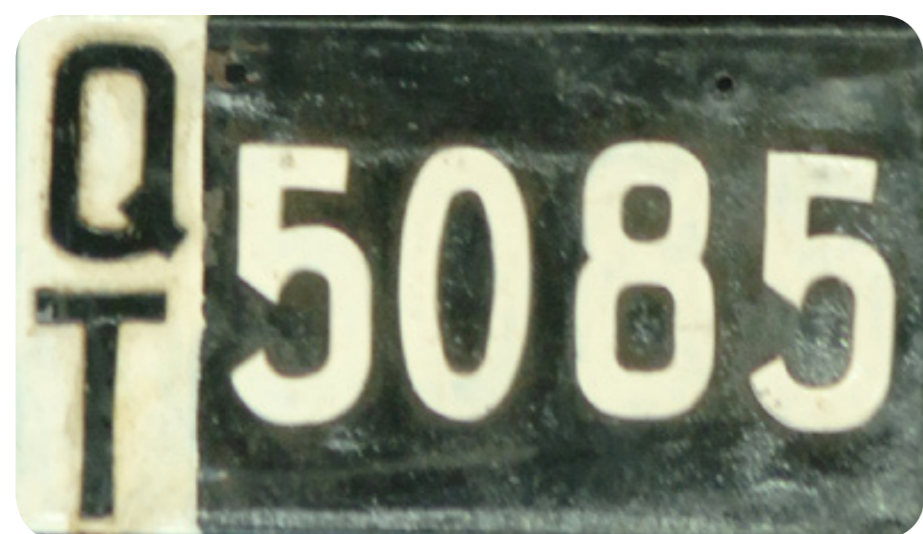
TRAILER 1925 – 1955