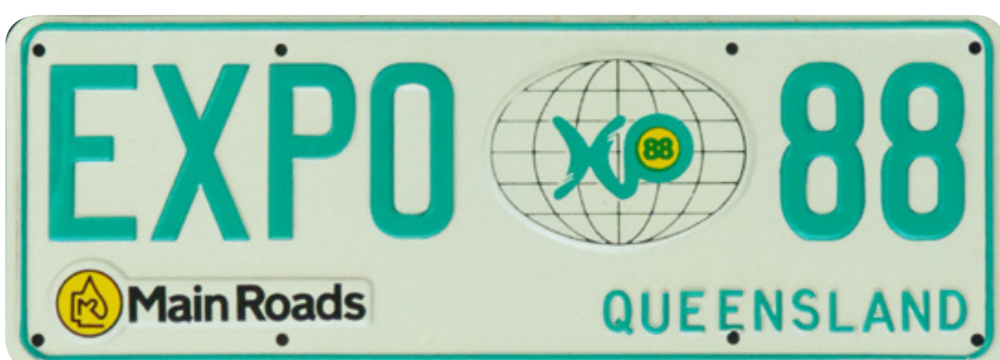
WORLD EXPO 88