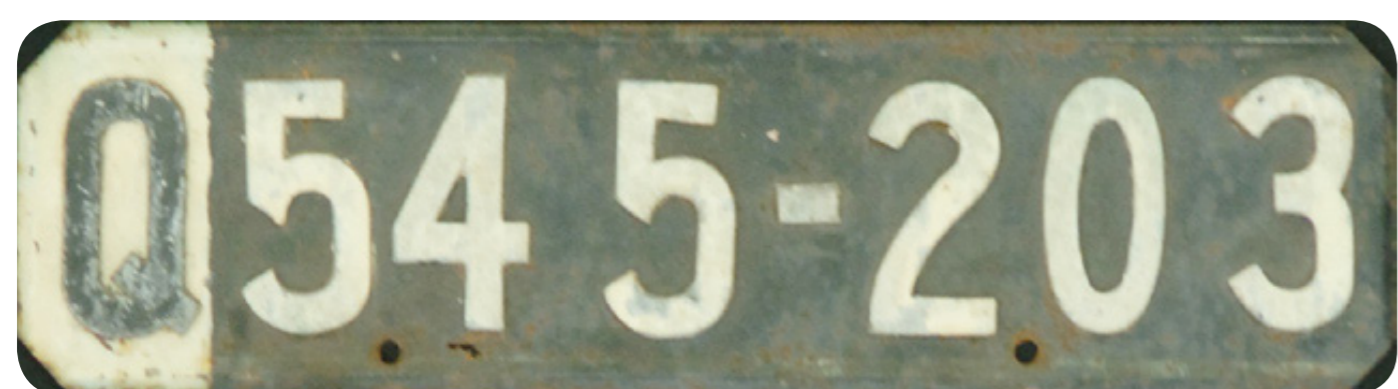
1937 – 1951