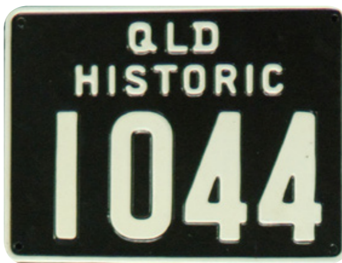
HISTORIC MOTOR VEHICLE 1979

The Veteran Motor Cycle Plate, coloured white on black was introduced on February 21, 1955 with 001. The series was issued to 199, then 300 to 999.