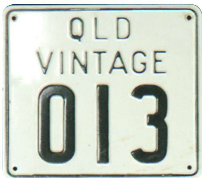
VINTAGE MOTOR VEHICLE 1970

A large square plate, slightly larger than the veteran and vintage motor vehicle plates. Coloured white on black, the Historic Motor Vehicle plate was introduced on November 23, 1979. The series runs from 1000-9999.