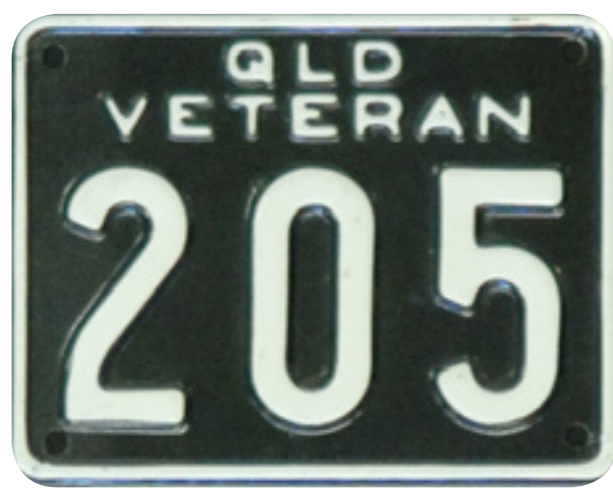
VETERAN MOTORCYCLE 1968

Issued to veteran motorcycles is a small square plate, coloured white on black. The series starts at 201 (issued on 31 May 1968), up to 299.