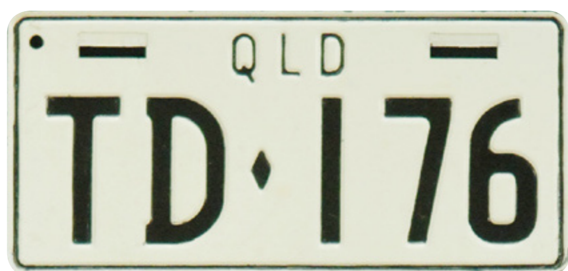
TRAILER DEALER PLATES

White legend on black background with QLD at top of plate. Series ran from N-000 to N-999, P-000 to P-999. These plates were issued from June 1, 1955 and withdrawn on December 18, 1962.