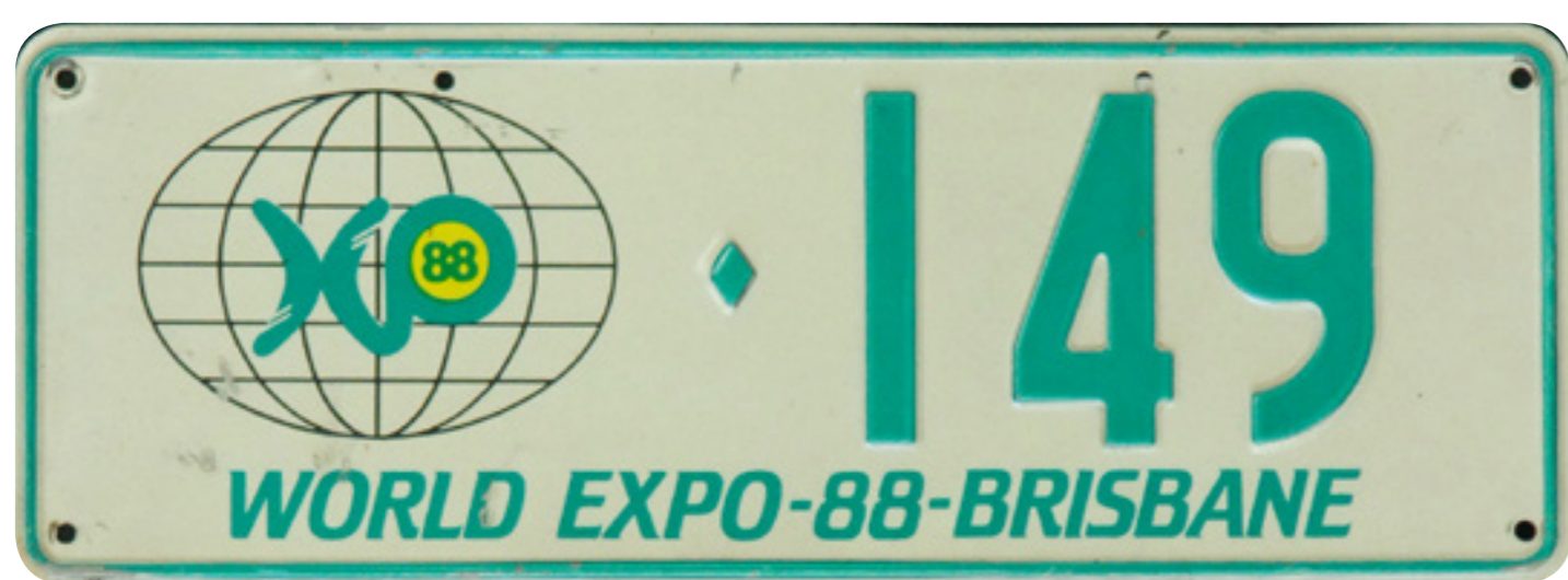
WORLD EXPO 88