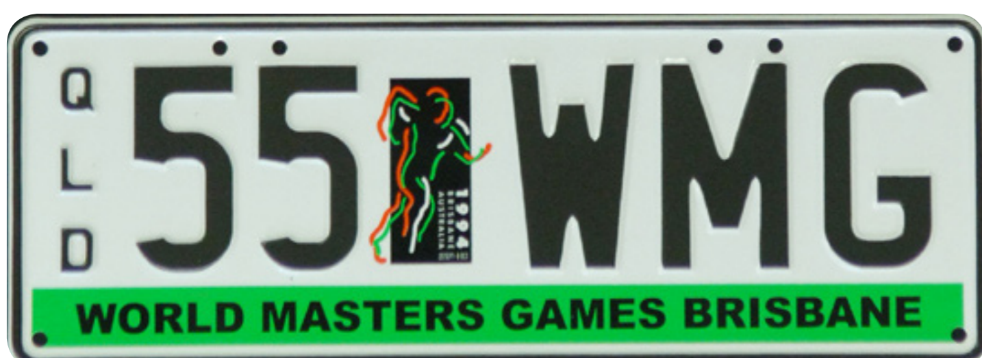
WORLD MASTERS GAMES