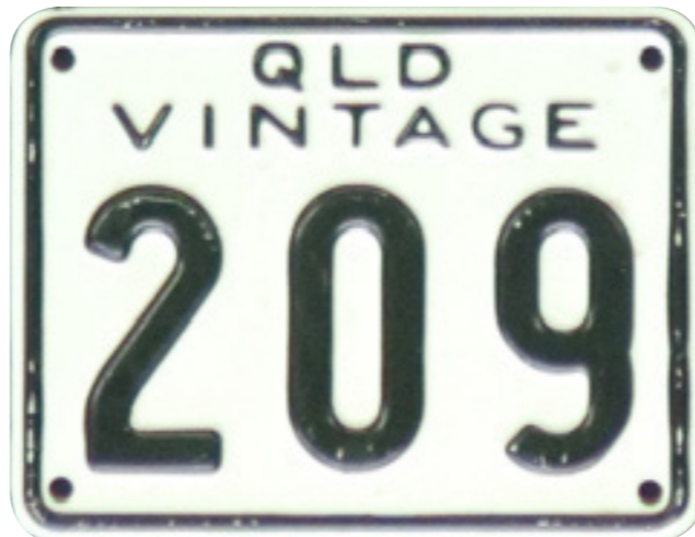
VINTAGE MOTORCYCLE 1969

Issued to veteran motorcycles is a small square plate, coloured white on black. The series starts at 201 (issued on 31 May 1968), up to 299.