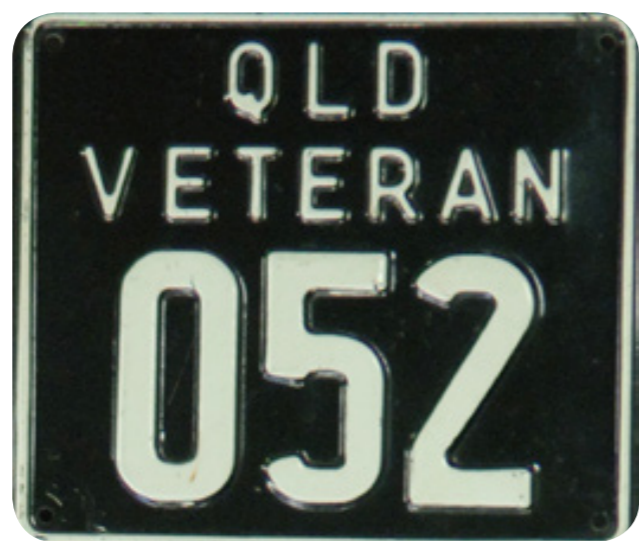
VETERAN MOTORCYCLE 1955

A small square plate, similar in size to the veteran and vintage motorcycle plates. Coloured white on black, the series runs from 100 to 999. Number 100 was issued on November 23, 1979.