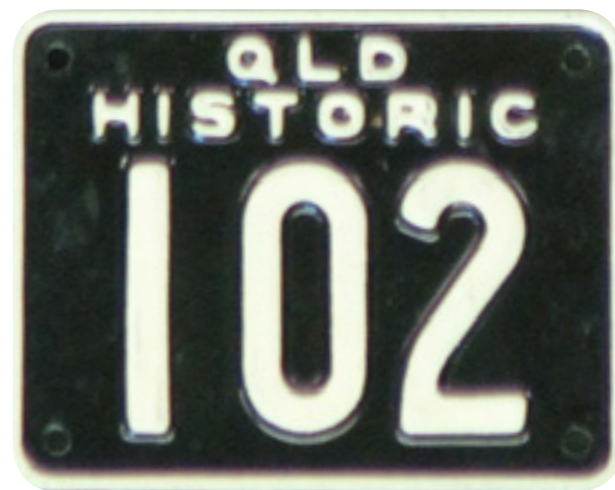
HISTORIC MOTORCYCLE 1979

A small square plate is issued to vintage motorcycles. The series starts at 200 (issued August 29, 1969). Variations: 200 to 209 – Black on White 210 to 299 – White on Black