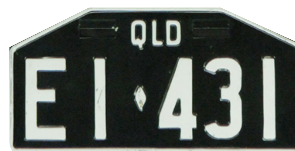
ADDITIONAL DEALER PLATES

White legend on black background on a six-sided plate. The first of the series, E-6000 was issued on 1 April 1968. The last of the series, E1-411 was issued on 31 March 1976.