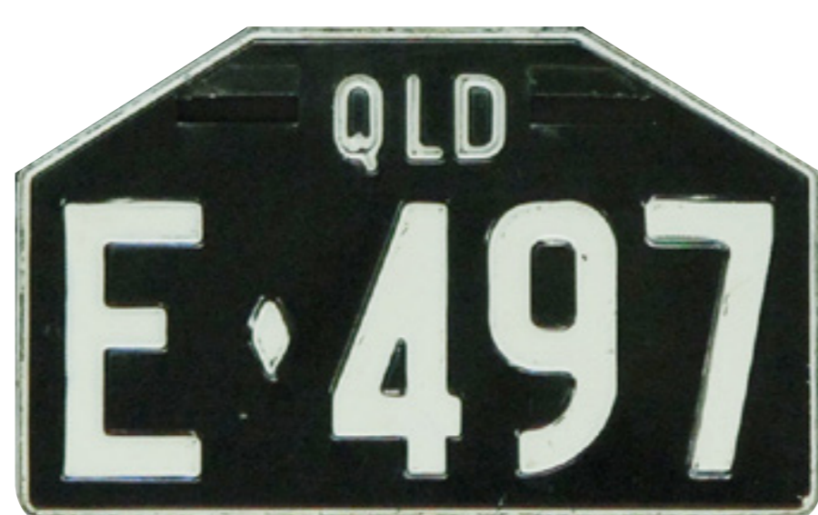
ADDITIONAL DEALER PLATES

Black legend on a white background. Series started at D1-000 on December 18, 1962, and the last of the series D3-496 was issued on 31 March 1976.