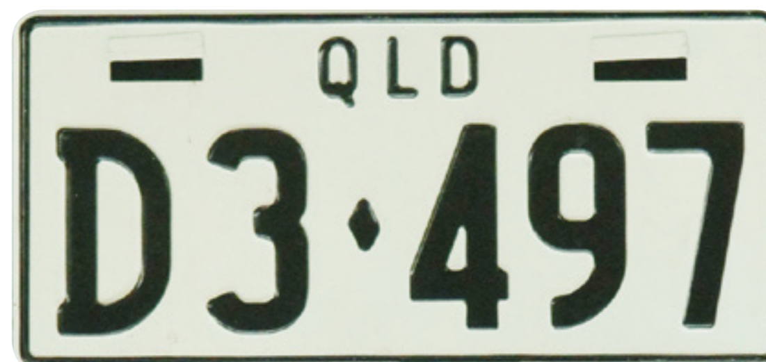
TRAILER DEALER PLATES

Black legend on a white background. Series ran from TD-000 to TD-999. TD-000 was issued on 1 January 1966 and the last of the series TD-539 was issued in 1976.